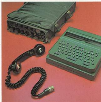
Other versions of MEROD are available with different parameters to meet specific requirements.